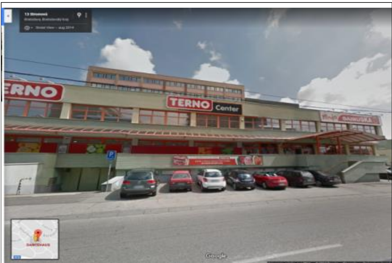
Figure 1: Dancehaus building

Free of charge underground car parking is available at the place – please ring the bell.