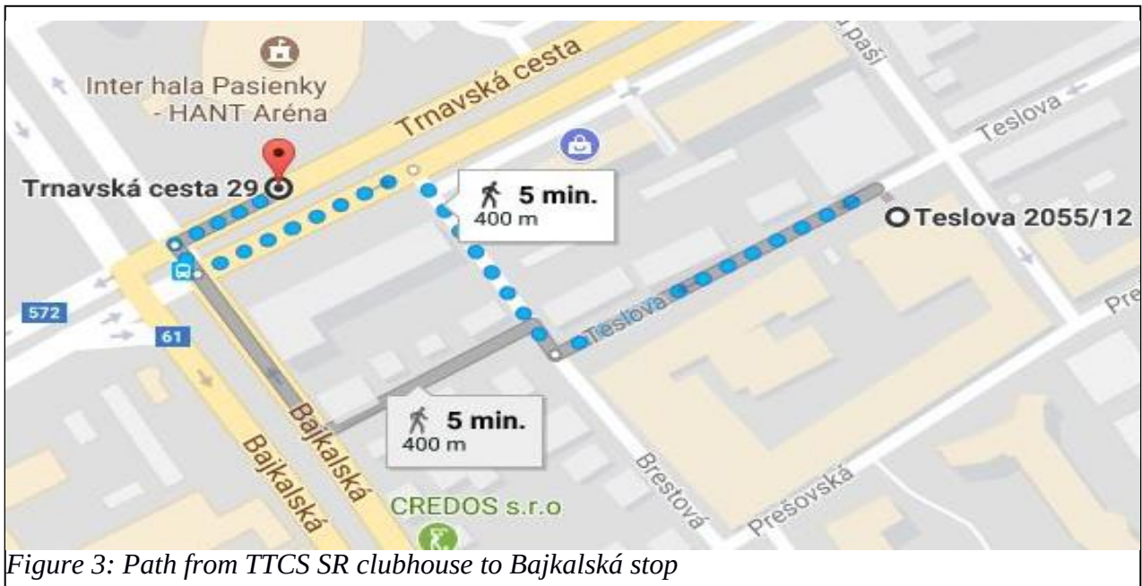
Figure 3: Path from TTCS SR clubhouse to Bajkalská stop

Trolleybus no. 204 direction Patrónka, from Bajkalská stop, step out at the Bárdošová stop. A 15 minute ticket suffices for the connection; price of the ticket is €0.70.